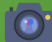
PHOTO PUBLICATION IN A PRIVATE BLOG WITH PASSWORD.